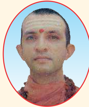
REV. PARAMHANS SWAMI NIRANJANANAND SARASWATI Paramacharya Bihar School of Yoga & Bihar Yoga Bharti Munger (Bihar)